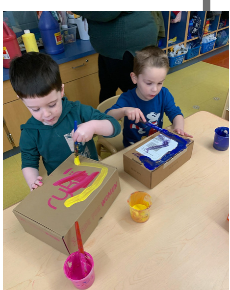
Ms. Pyron's class painted boxes and voted as a team what they wanted each building to look like and what type of building they wanted them to be.