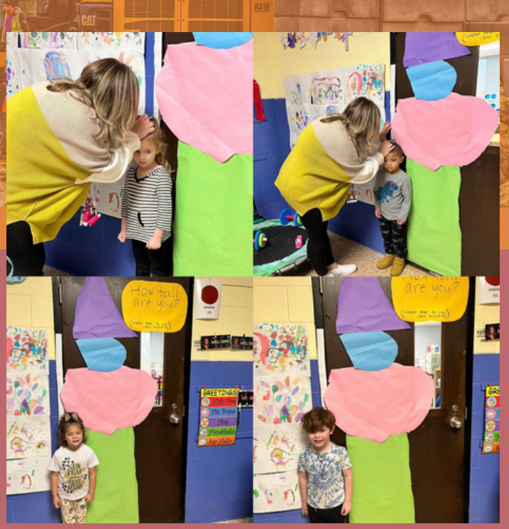
Ms. Josephs class built a class building and measured their heights next to it!